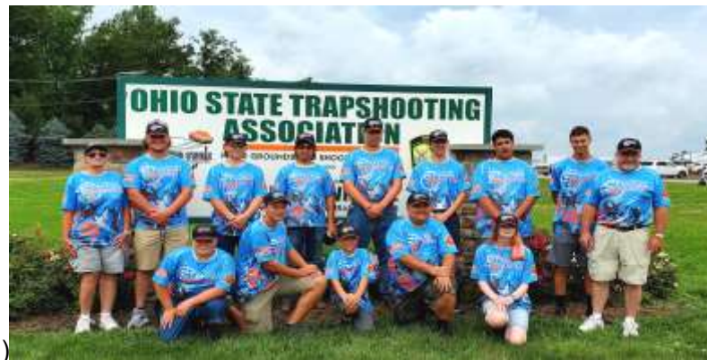
2021 St. Joe County "Straight Shooters" Trap Team attending SCTP Nationals in Ohio

St. Joseph County Conservation & Sportsman Club, Inc. promotes the shotgun shooting sports through several active youth programs. Our county-wide club team is the St. Joe County Straight Shooters and has 5 certified shotgun coaches. The youth involved range in age from 9 years old (4H) to 22 years old (AIM), depending on the specific program. We believe the future of our sport will continue if we help our youth become responsible, active participants. The teams have received NRA Foundation and MidwayUSA Foundation Grants to help support youth participation in these youth development programs. Call 269-483-6803 for details on these youth programs.